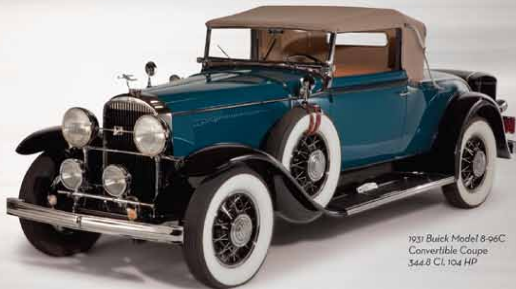
1931 Buick Model 8-96C Convertible Coupe 344.8 CI, 104 HP

Join us for the spectacular 30th annual Arthritis Foundation Classic Auto Show & Cruise-In! Our Featured Marques for 2012 will celebrate the 110th Anniversary of Cadillac, 45th Anniversary of Chevrolet Camaro, and the 45th Anniversary of Mercury Cougar.