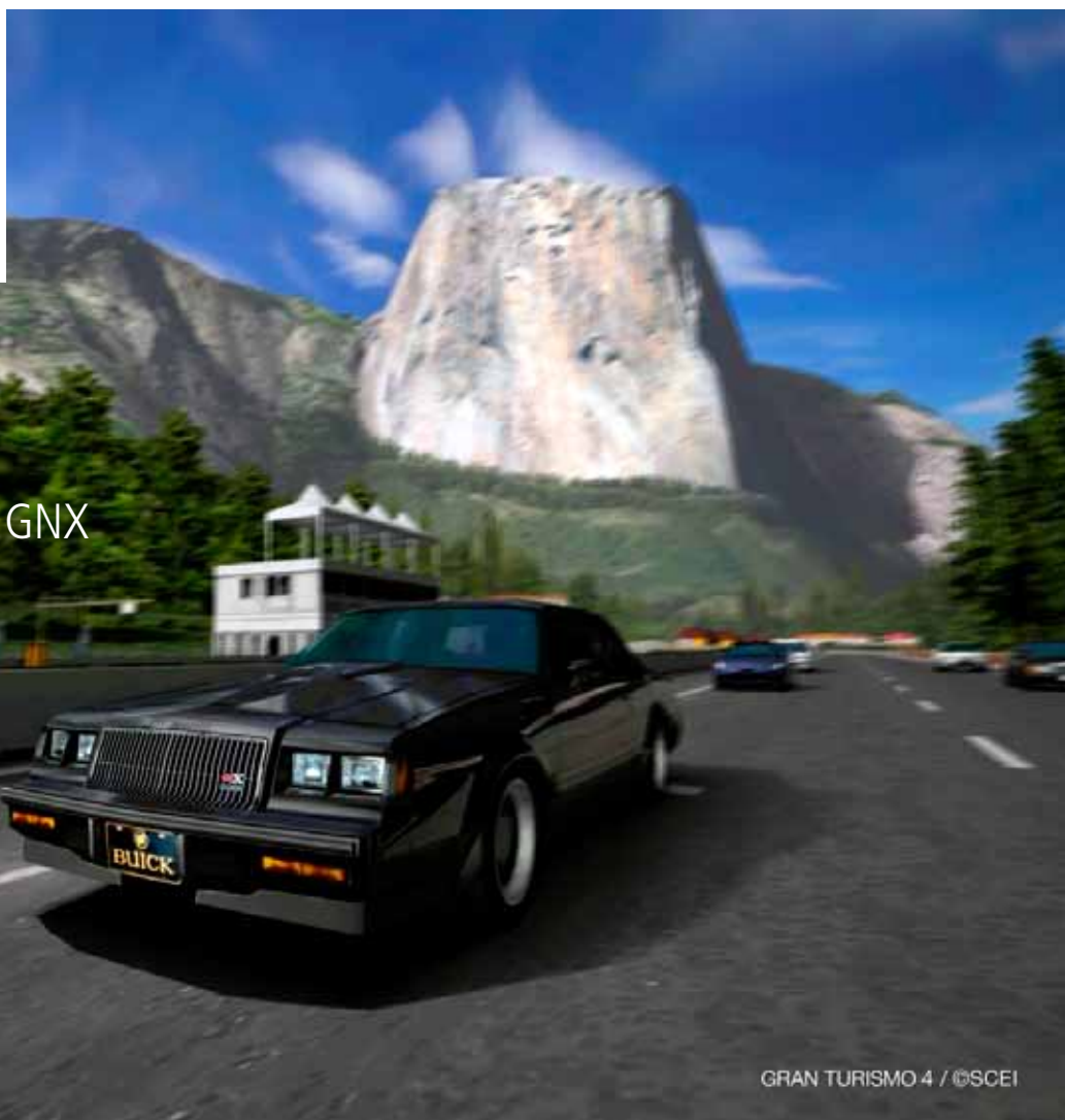
Buick's mighty 1987 GNX