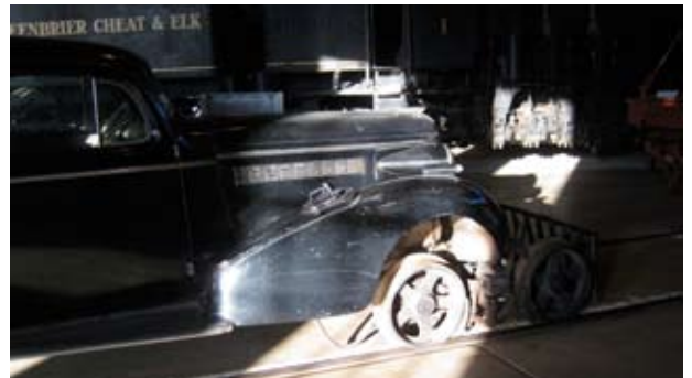
The MaPa was installed with a 2 way radio to test the practicality of radio communication between locomotives and stations.

Shortly after their debut in the early 20th century, automobiles were adapted for use on the railroad. Rebuilt with flanged wheels, rail-mobiles carried management official on maintenance of way inspection trips. The Maryland & Pennsylvania Railroad (Ma & Pa) No. 101 was originally owned by the Harkins Funeral Home in Pennsylvania. The Ma & Pa was rebuilt in 1942 with a track sander for slippery rails. This car is located in the B&O Railroad Museum in Baltimore, MD.