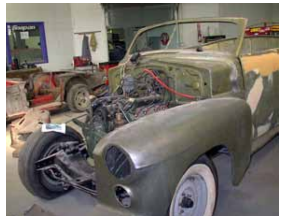
1941 Cadillac Coupe in the shop