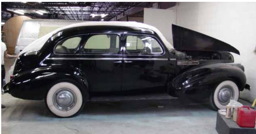
A restored 1940 Buick Limited Model 81 done by ACE