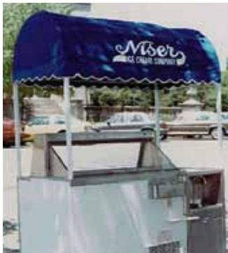
One of the many ice cream carts built by ACE